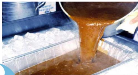
Shallow Pans (not deeper than 2 inches)